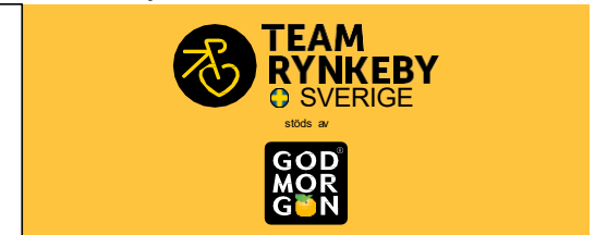
Logo with supporting juice version 2 Secondary version

Secondary logo for showing support from the juice brand.